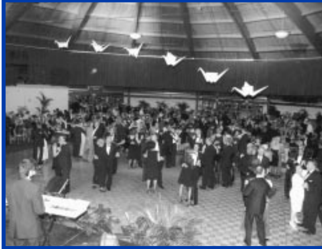
Revelers enjoy a previous YNHH Gala at the Oakdale – now Chevrolet – Theatre in Wallingford.