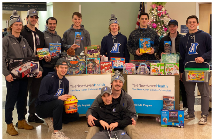
Albertus Magnus Men's Hockey Team holiday toy donation