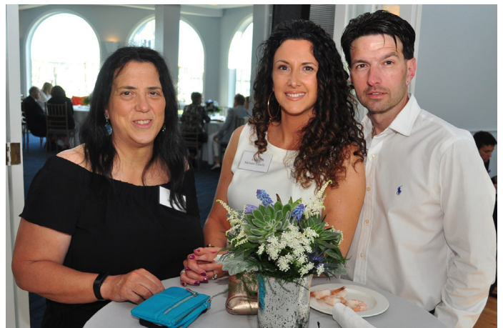
YNHH In Gratitude Donor Reception