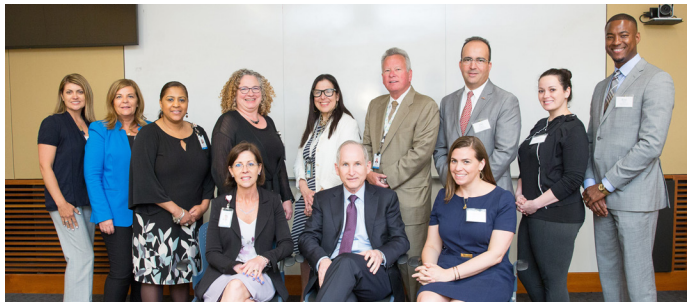
Eli Lilly and Company, Lilly Oncology Donation Luncheon