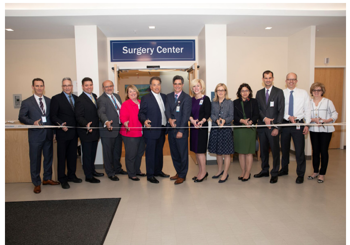
Completion of the expanded and renovated Shoreline Medical Center