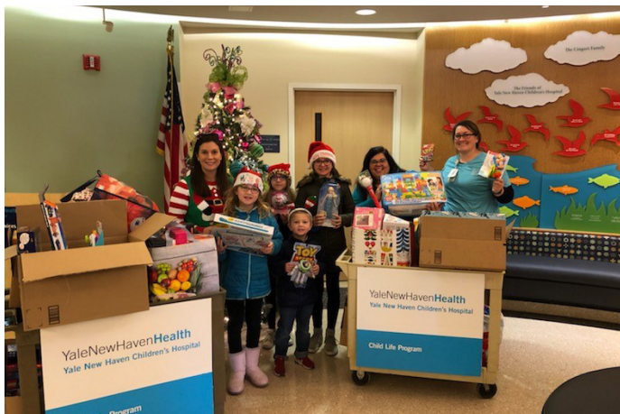
The Peter Aliapouloulios Memorial Trust Holiday Toy Donation