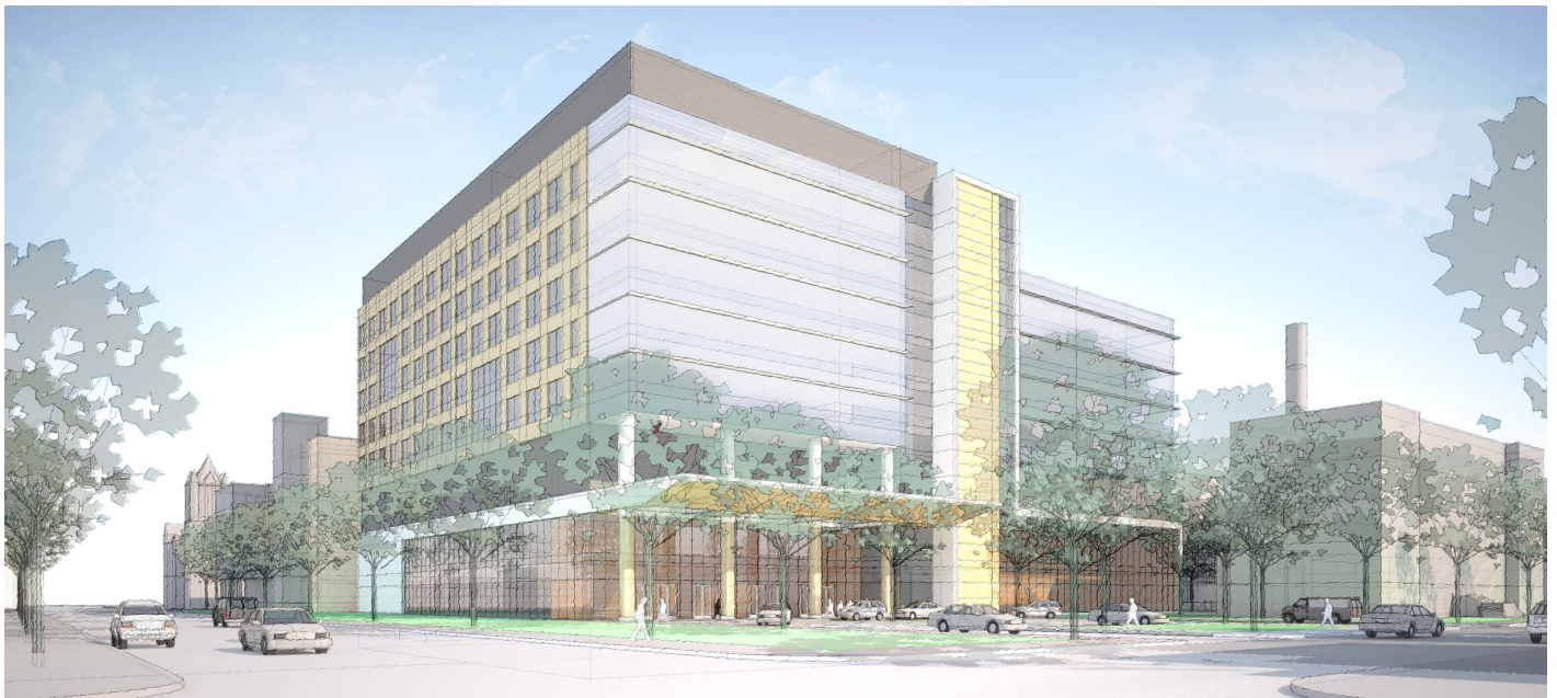
An architectural rendering of the proposed neurosciences center.