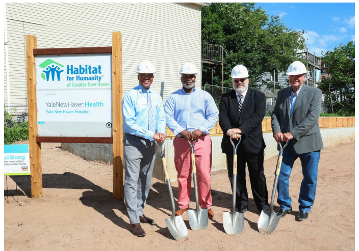
YNHH and Habitat for Humanity of Greater New Haven broke ground for two new houses.