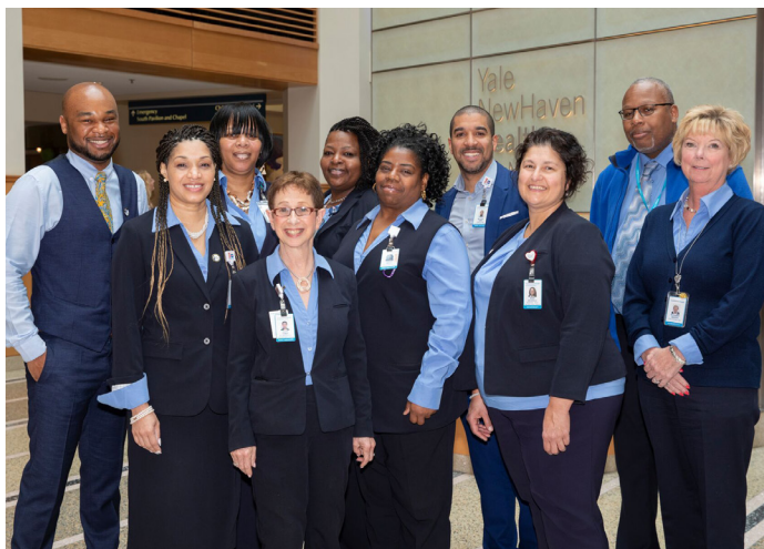
New Patient Experience ambassadors