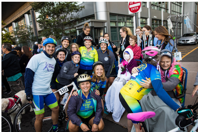
Closer to Free Bike Ride 2019