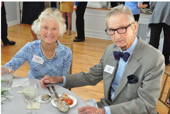
YNHH In Gratitude Donor Reception