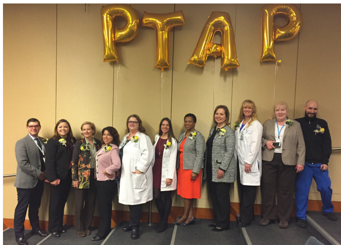
YNHH's Nurse Residency Program earned accreditation with distinction.