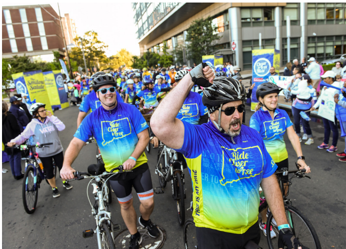
Closer to Free Bike Ride