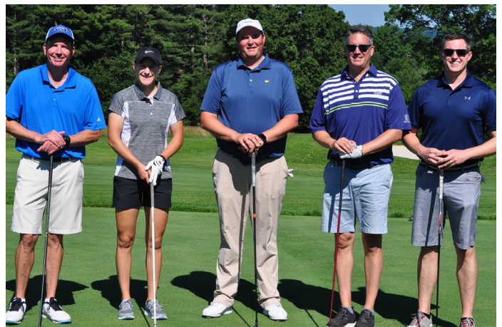
The Seventh Annual YNHG Golf Classic