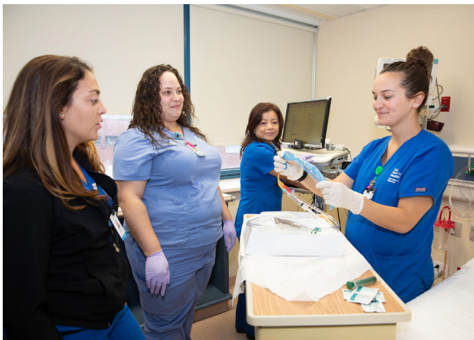
Neurosciences ICU staff members review safety procedures to prevent CAUTI.