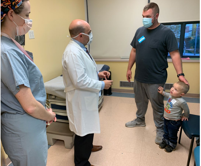
Extended hours in the Pediatric Specialty Center has been met with positive feedback from parents and families.