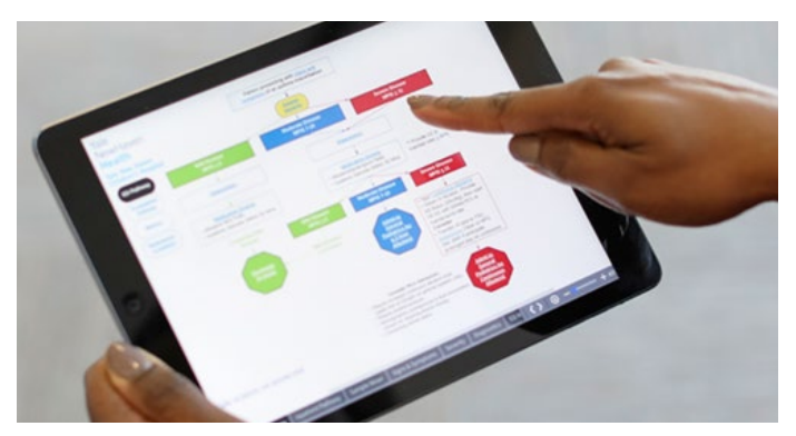
Care Signature pathways are like a GPS for clinical navigation