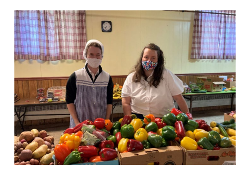
Employees generously donated more than 7,700 meals to help combat food insecurity in local communities