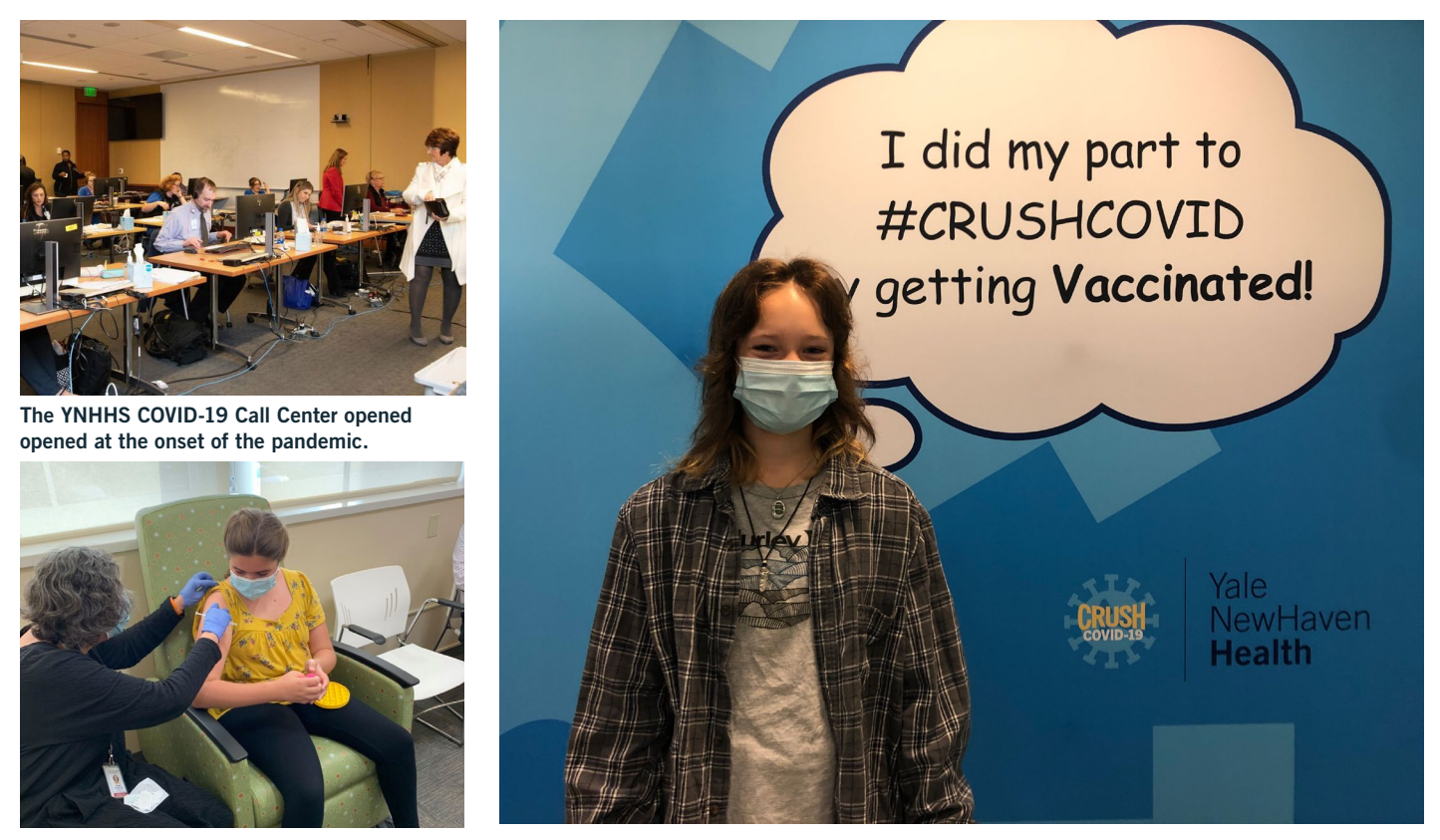
Yale New Haven lead the pediatric COVID-19 vaccination program for the State of CT.

In November 2021, Yale New Haven began giving children their first dose of the Pfizer COVID-19 vaccine at sites across Connecticut. Yale New Haven Children's Hospital joined in a national campaign to ensure children and families access to resources and safe, ageappropriate vaccination sites in their local communities. Selected by the State of Connecticut to lead the pediatric COVID-19 vaccination initiative, Yale New Haven also distributed vaccine doses to pediatricians' offices around the state.