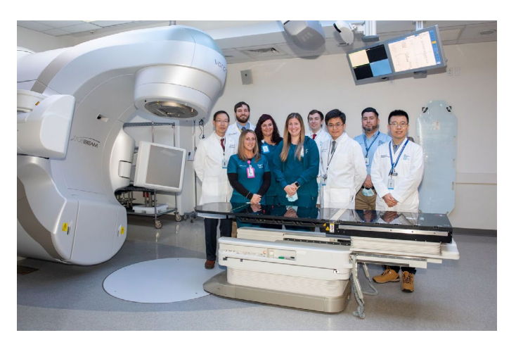
The new linear accelerator is part of ongoing upgrades to radiation oncology technology throughout the Smilow network.

Smilow Cancer Hospital at Yale New Haven installed the new Varian TrueBeam linear accelerator which delivers advanced radiation therapy treatments quickly and with pinpoint accuracy. The new accelerator can focus the center of the radiation beam to less than 1 mm, precisely targeting tumors while avoiding surrounding healthy tissues. It also delivers radiation doses more quickly, so patients spend less time on the treatment table.