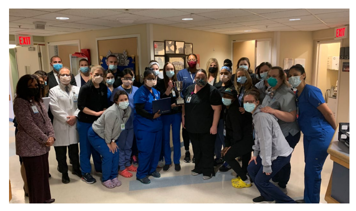
Staff on the Medicine/Sickle Cell unit won the inaugural Capacity Champions Cup award

The 1,000 day club is an initiative launched in 2022 that recognizes units for going 1,000 consecutive days without a central line-associated bloodstream infection (CLABSI) and/or a catheter-associated urinary tract infection (CAUTI).