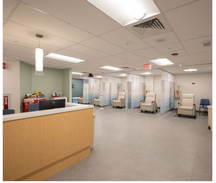
The new ED Annex provides much needed additional space for the treatment of illnesses and injuries.