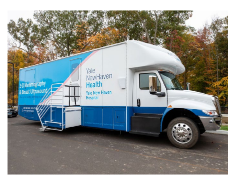
The newly renovated mammography van travels throughout the state providing screening services.