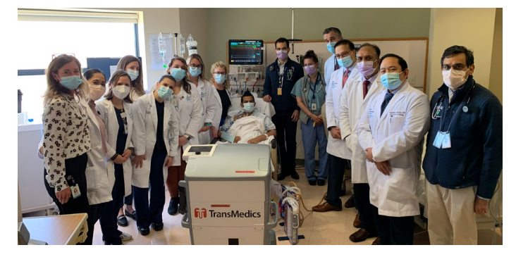
YNHH is one of only a few hospitals nationwide to use the heart in a box technology.

Yale New Haven Transplantation Center performed the first liver transplant in Connecticut from an HIV-positive (deceased) donor to an HIV-positive patient. YNHH is one of only 17 centers in United States with the ability to enroll its patients in the HOPE in Action Clinical Trial, sponsored by the National Institutes of Health.