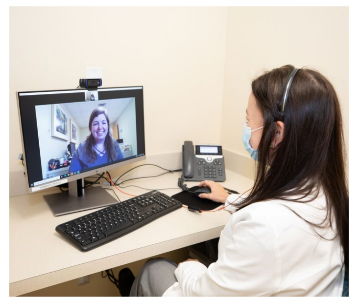
The popularity of telehealth visits increased significantly since the onset of the pandemic.

Yale New Haven Children's Hospital launched a program that extends hours to evenings and Saturdays at several of its Pediatric Specialty Centers for in-person and telehealth visits, making it easier for families to access expert care. In addition to enhancing patient- and family-centered care, the extended hours are helping the specialty centers "catch up" with patients whose care might have been delayed during the height of the COVID-19 pandemic.