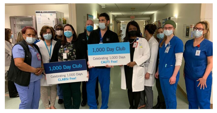
Staff on Celentano 4 at the Saint Raphael Campus were one of 20 units to celebrate moving into the 1,000 Day Club

Partnering with YNHHS, Yale New Haven Hospital enhanced its Care Signature pathways designed to provide clinicians and patients with a consistent best practice standard of care for various conditions. These pathways improve the quality and safety of care, promote patient education and equity and reduce unnecessary tests. More than 400 Care Signature Pathways have been introduced across the health system, including guidance for mechanical ventilation, treating Monkey Pox and detecting heart attacks. Other health systems are modeling similar guidance based on YNHHS Care Signature pathways.