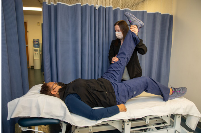
Newsweek magazine named YNHH's Rehabilitation and Wellness Center a top Physical Rehabilitation Center.