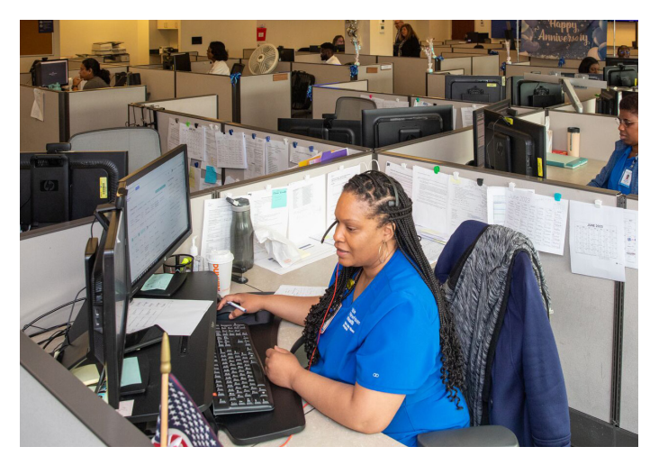
Clinicians at Home Hospital mission control remotely monitor patients.

YNHH even increased services in the air by officially launching its second SkyHealth critical care transport helicopter, with YNHH critical care flight nurses and paramedics as the clinical crew.