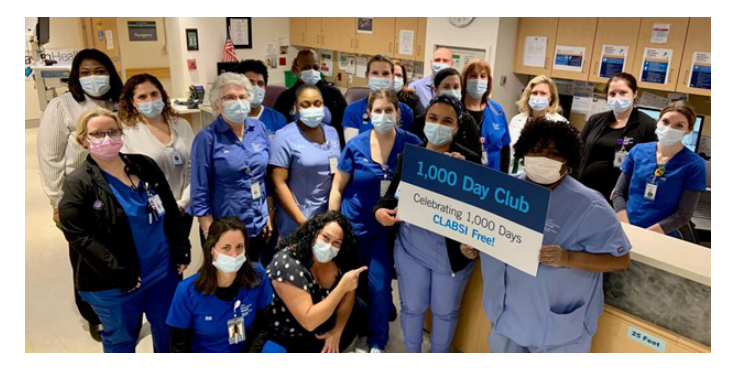
Several YNHH units were welcomed into the 1,000 day club for surpassing 1,0000 days without a catheter-associated urinary tract infection (CAUTI) or a central-line associated bloodstream infection (CLABSI).

Yale New Haven Hospital prides itself on delivering safe, quality care with excellence. Through a number of initiatives, the hospital continues to excel in these critical areas. Among them, YNHH continues to recognize medical units for preventing dangerous hospital-acquired infections.