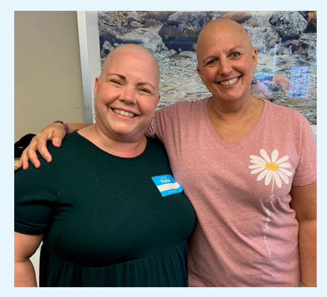
Patients share a laugh at a Beyond Beauty Program workshop sponsored by Smilow Cancer Hospital.

Elevating a culture of excellence extends beyond direct clinical care. Also important is elevating the patient experience. A program launched at Smilow Cancer Hospital is all about boosting the patient's emotional wellbeing. The Beyond Beauty Program, a new workshop offered to Smilow patients, is designed to address the visual side effects, challenges and changes patients often experience during cancer treatments. The sessions, facilitated by licensed cosmetologists and certified hair and wig specialists, is sponsored by Smilow's Cingari Family Boutique and the Yale New Haven Hospital Auxiliary. Workshops are hosted at Smilow Centers around the state and addresses self-care topics with step-by-step lessons and best practices, while also building confidence and self-esteem that patients may lose as a result of the physical changes that can sometimes come with their treatment.