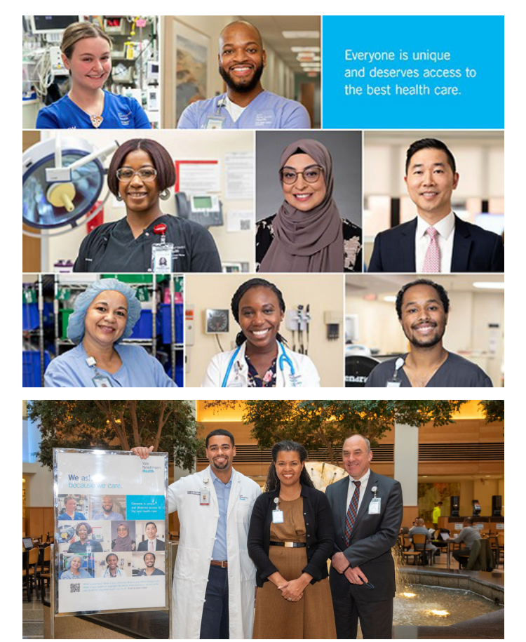
Leaders launched the We Ask Because We Care campaign.

Yale New Haven Hospital continues to be recognized as among the nation's best healthcare providers in many areas. YNHH ranked nationally in 8 of 16 specialties in the national U.S. News & World Report's annual "America's Best Hospitals" listing; more than 370 Yale New Haven Hospital-affiliated physicians were named to Connecticut Magazine's 2023 Top Doctors list; and YNHHS ranked 20th on the DiversityInc 2023 Top 50 Hospitals and Health Systems List in recognition of its commitment to excellence in key areas of diversity and inclusion management. Additionally, Newsweek magazine named YNHH's Rehabilitation and Wellness Center a top Physical Rehabilitation Center for 2023, ranking it #4 in the Northeast and among the top 50 in the nation.