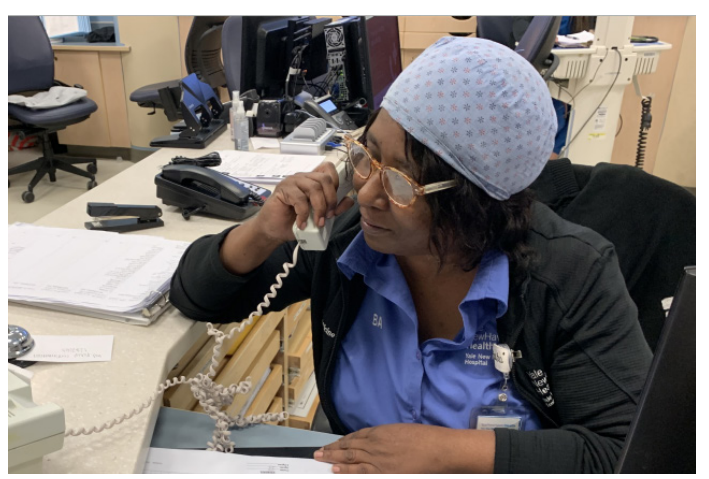
Team members in the Transportation Hub enter orders for transport when a patient is ready to be discharged from the hospital.