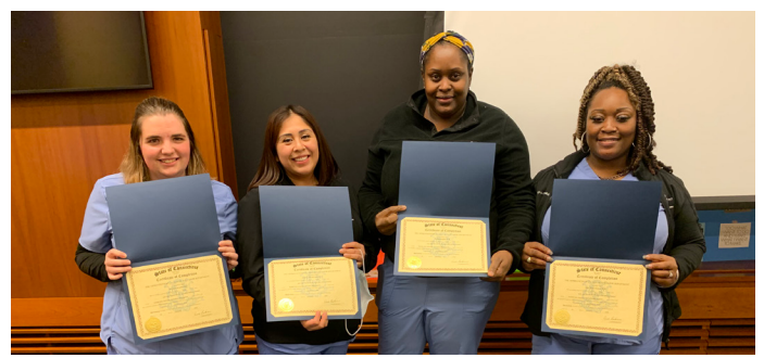
The first program graduates of the PCA Apprenticeship Program are hard at work in their new roles.