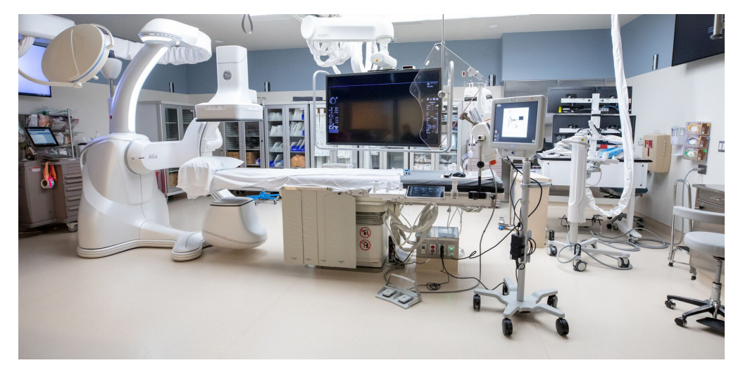
The Heart and Vascular Center (HVC) added a single-plane angiography unit, used for complex interventional radiology (IR) procedures.

In addition, the Heart and Vascular Center (HVC) added a singleplane angiography unit, used for complex interventional radiology (IR) procedures, supporting image-guided, non-surgical treatments. Plus, a new state-of-the-art angiography unit was installed at the Saint Raphael Campus for interventional radiology procedures, often reducing the need for traditional surgery.