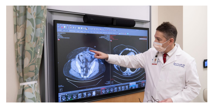
New Digestive Health services in opened in North Haven and Westbrook.