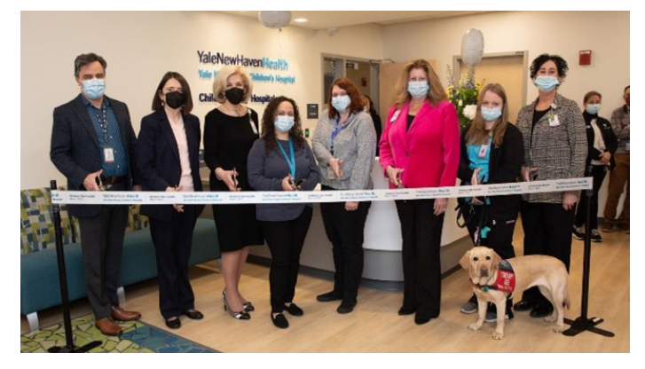
New Children's Day Hospital provides special care for pediatric patients with behavioral issues.

SkyHealth times two! Yale New Haven added a second helicopter to its fleet.