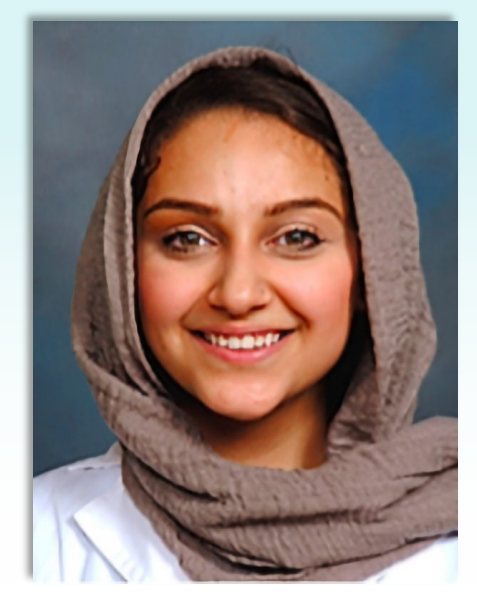
PGY1 Community-Based Residents: Yale New Haven Hospital