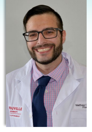
PGY1 Residents: Bridgeport Hospital